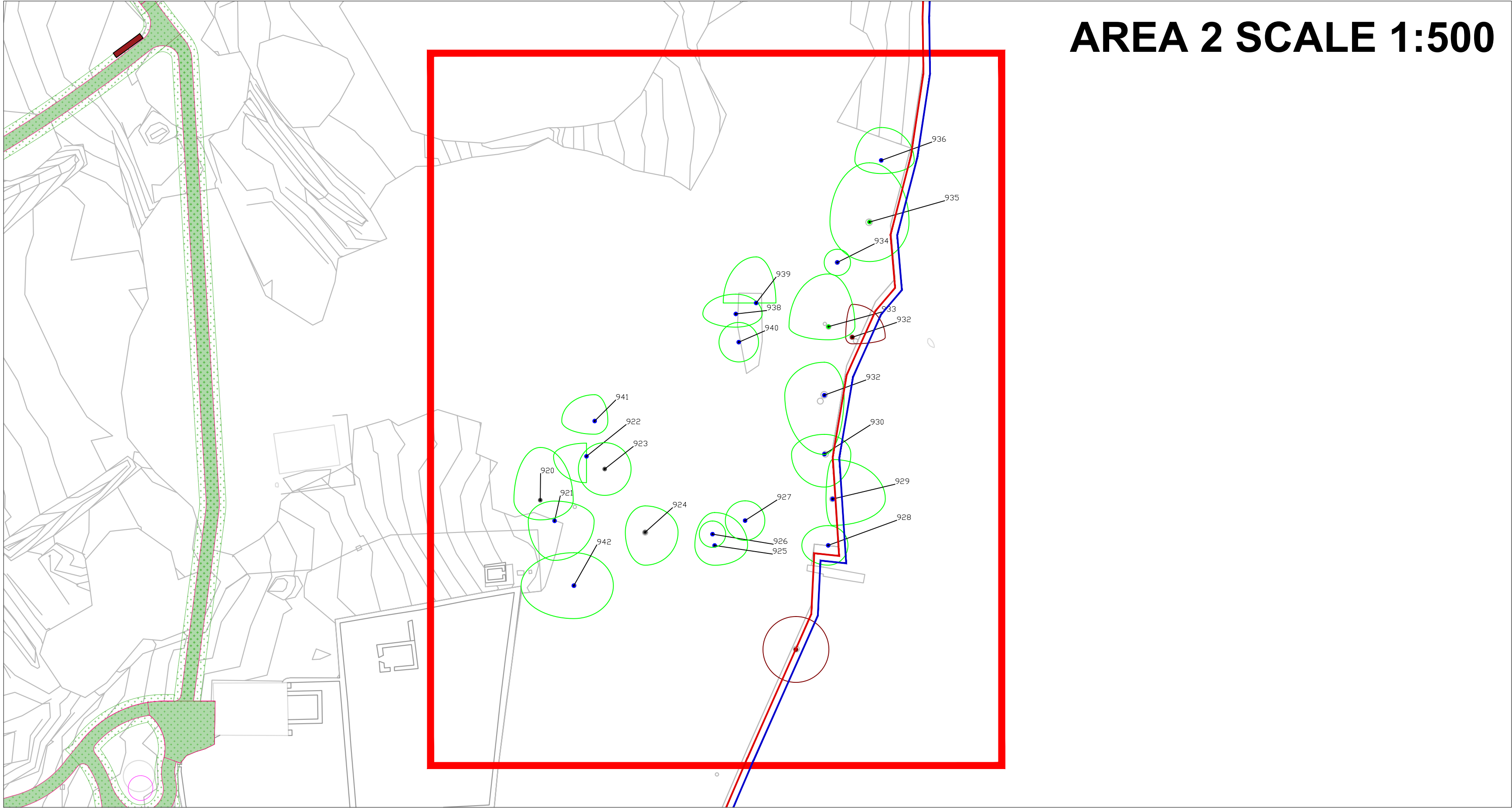
AREA 2 SCALE 1:500